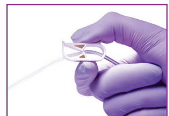
Closed position, pump is not infusing.