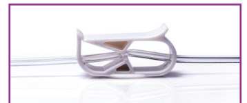
Closed position, pump is not infusing.