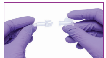
Remove patient end cap.